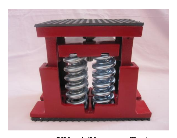
YN – 4 (Neoprene Top)

Above products will also be available in blue