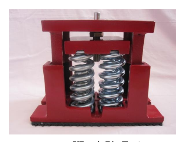
YP - 4 (Pin Top)