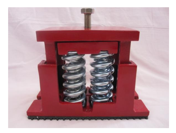
YE – 4 (Bolt Top)

Type "Y-4" series mounts with two inch deflection solve critical vibration problems. These mounts are preferred over one inch deflection spring mounts and most rubber mounts due to their higher static deflection. These mounts are normally recommended for building structures where negligible vibration transmission to the building is required. "Y-4" type spring mounts with two inch deflection are designed for noise and vibration control application in critical areas on concrete.